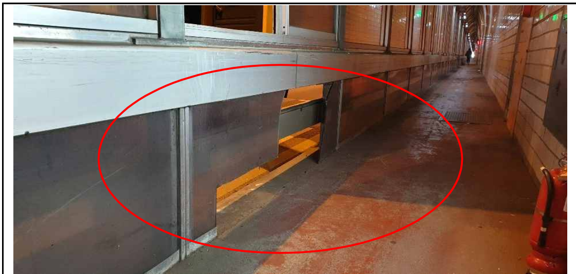
보차도분리벽 하부판 파손(노들역 방향)