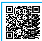
Go to the SDA 2024 Submission