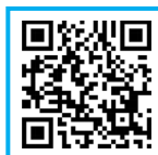
Call for Entry