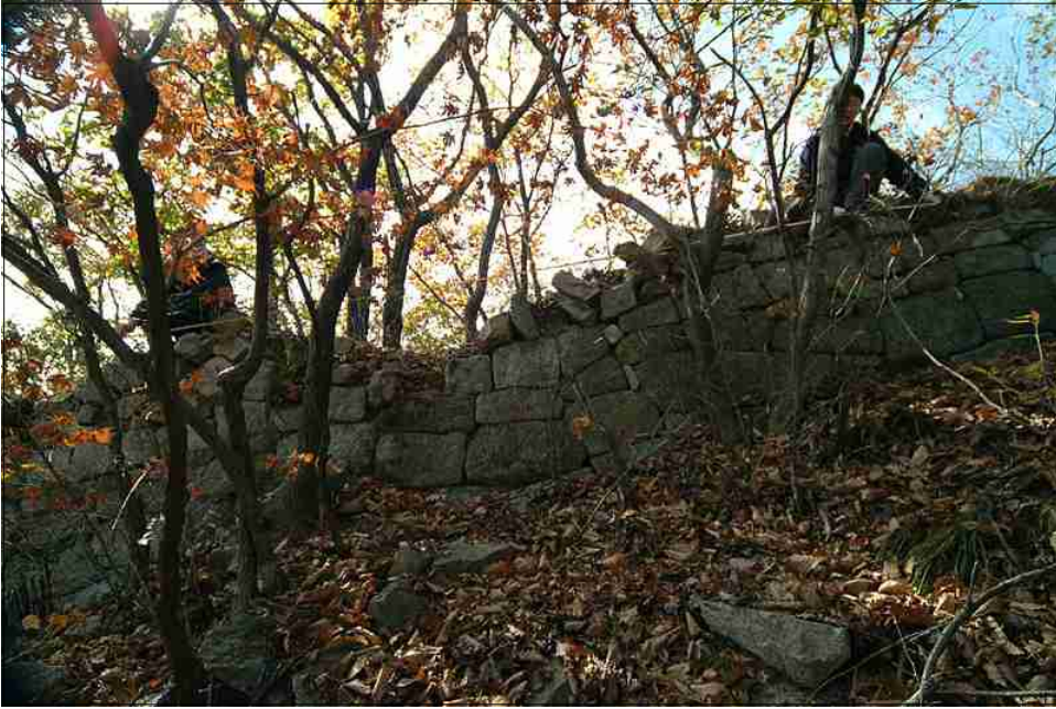
NO.35 +17 ~ NO.36 +2