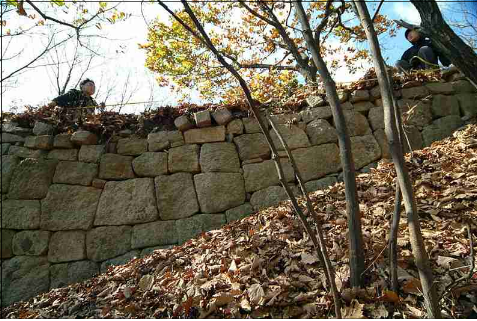
NO.39 +15 ~ NO.40 +0