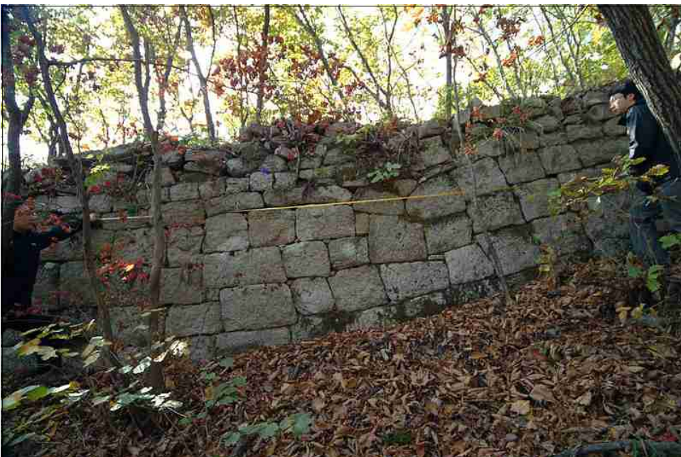
NO.33 +9 ~ +13