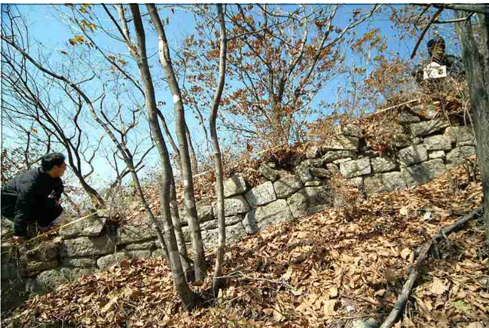
NO.40 +5 ~ +10