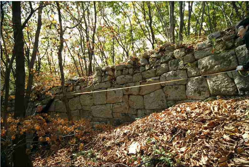
NO.33 +18 ~ NO.34 +3