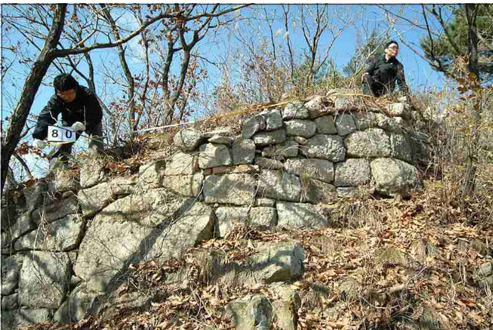
NO.40 +18 ~ NO.41 +2