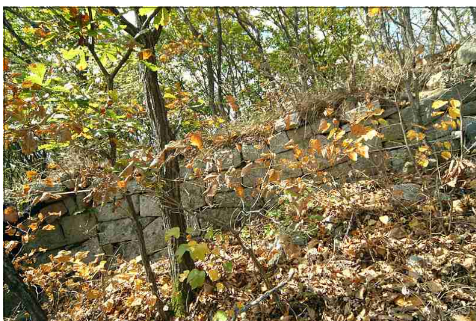
NO.34 +18 ~ NO.35 +3