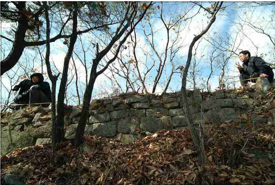
NO.38 +0 ~ +5