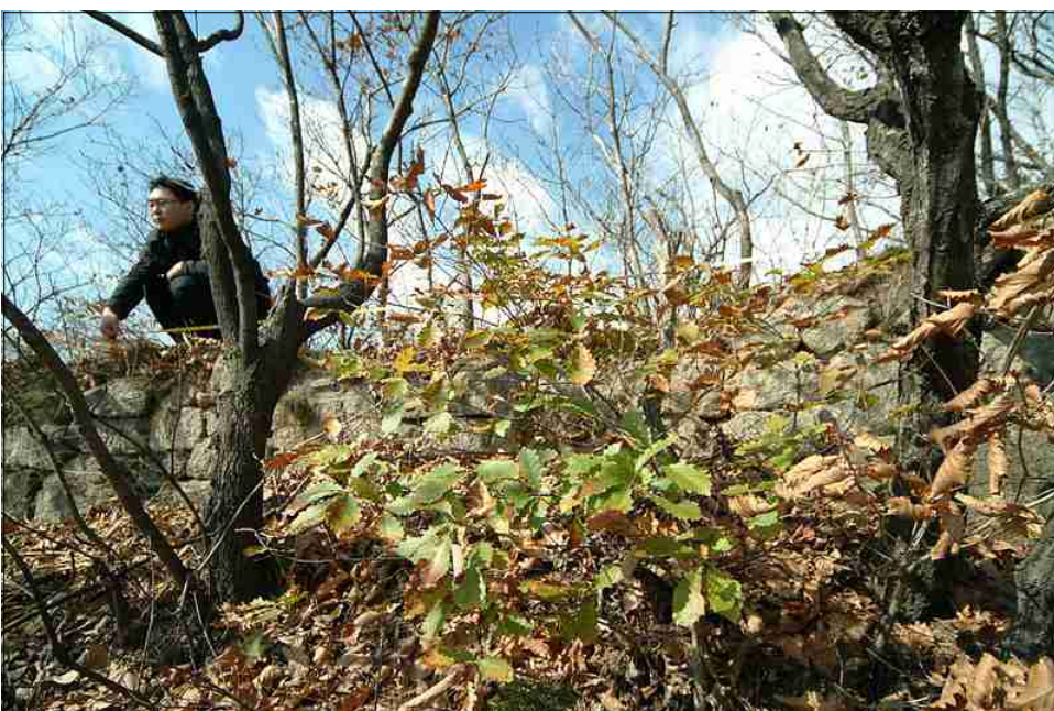
NO.37 +15 ~ +18