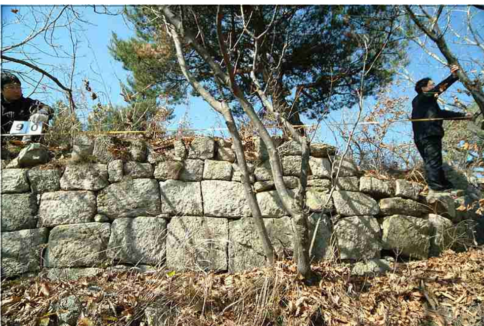
NO.41 +8 ~ +12