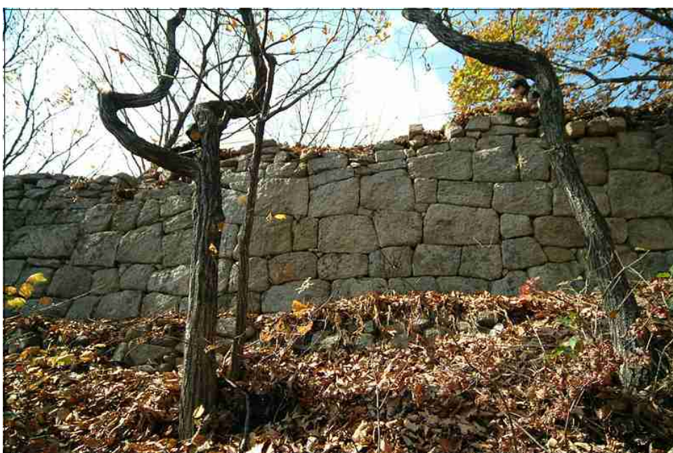
NO.39 +10 ~ +15