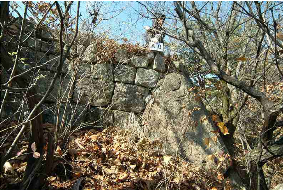
NO.43 +14 ~ +18