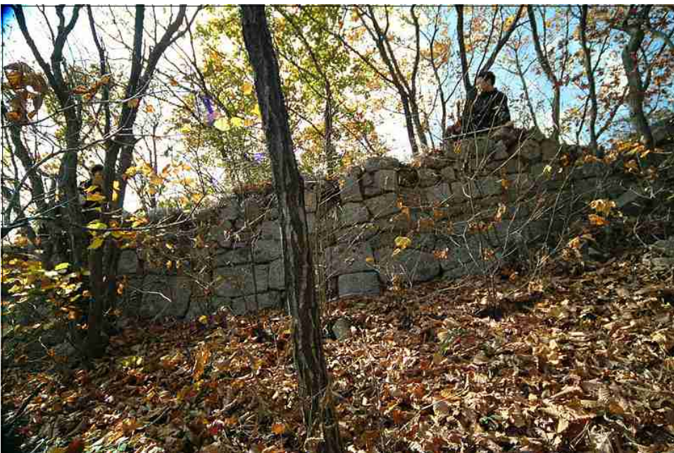
NO.35 +13 ~ +17