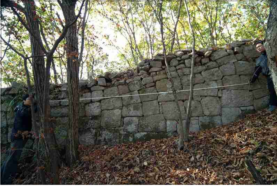
NO.33 +13 ~ +18