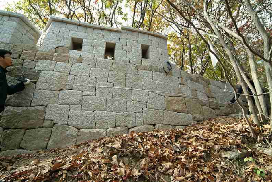
NO.32 +5 ~ +10