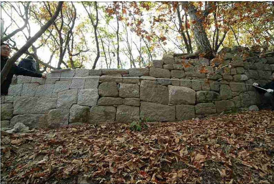
NO.32 +10 ~ +14