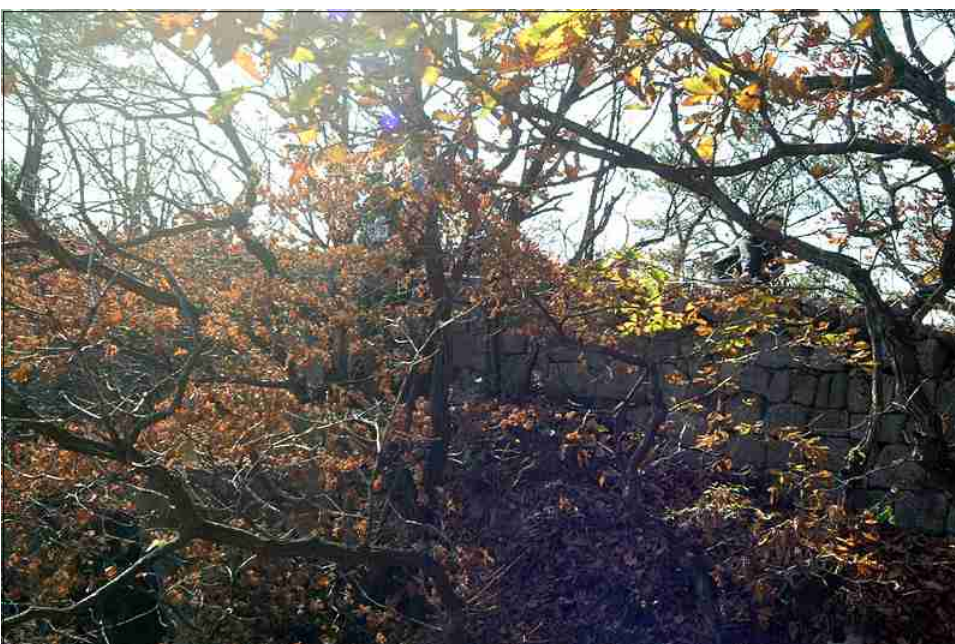
NO.43 +18 ~ NO.44 +3