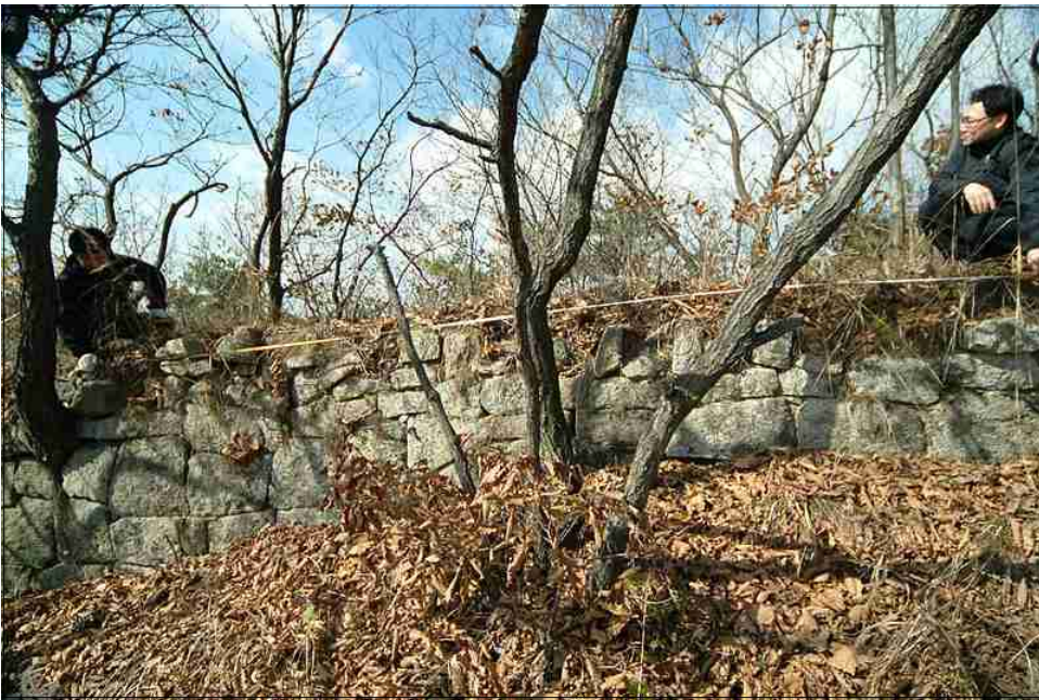
NO.37 +10 ~ +15