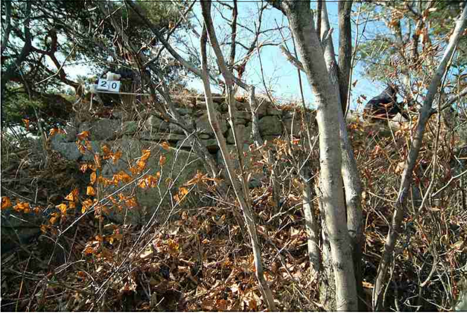
NO.42 +16 ~ NO.43 +0