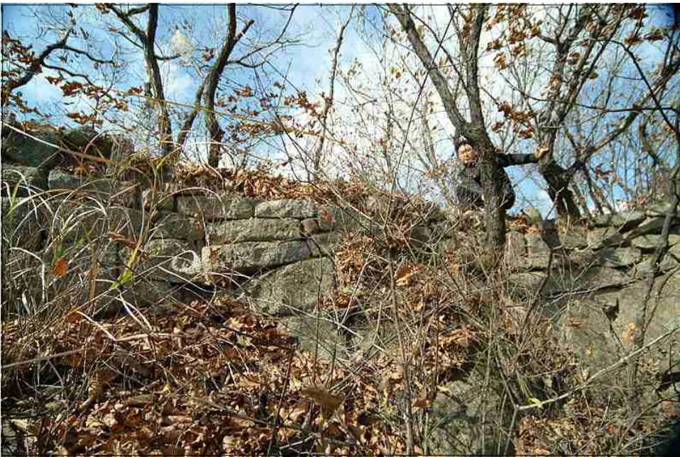
NO.38 +13 ~ +15