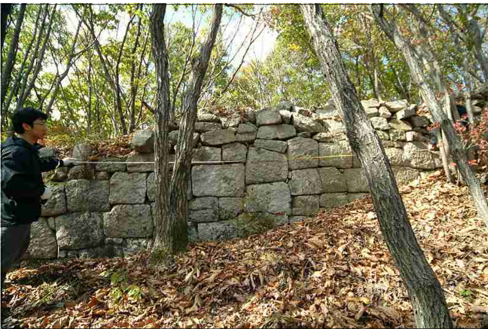
NO.34 +3 ~ +8