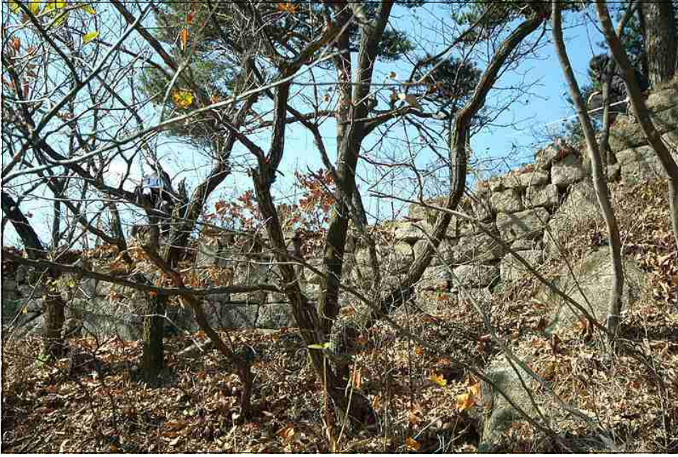
NO.42 +5 ~ +10