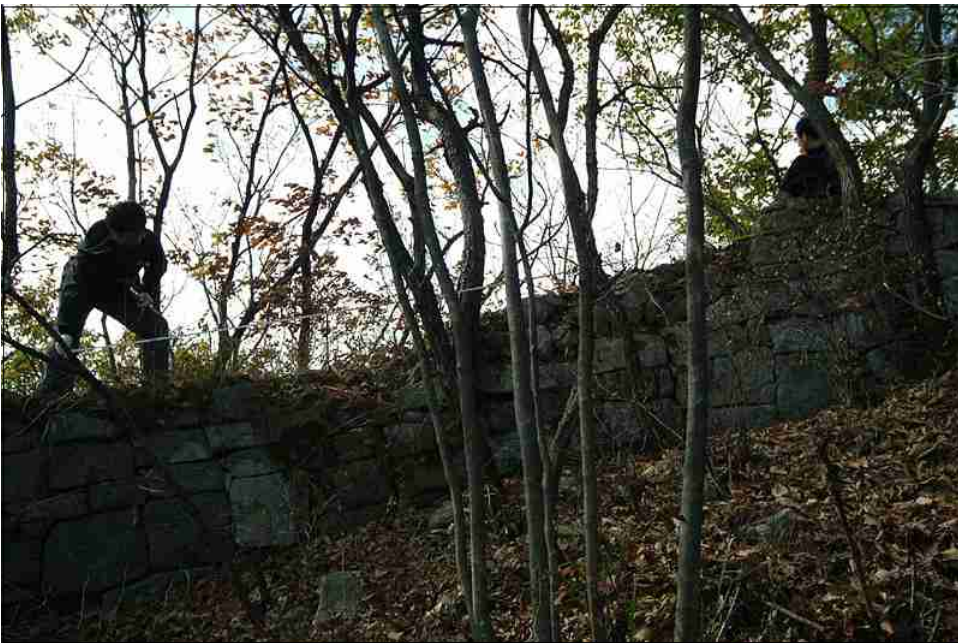
NO.36 +2 ~ +7