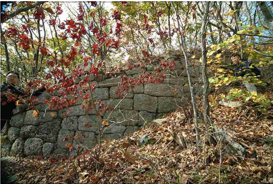
NO.35 +8 ~ +13