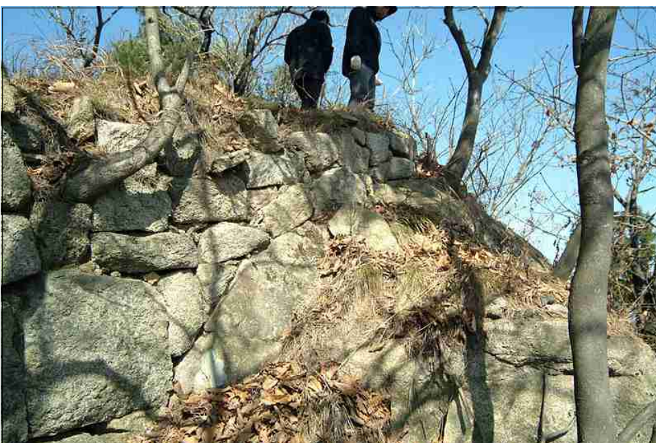
NO.42 +13 ~ +16