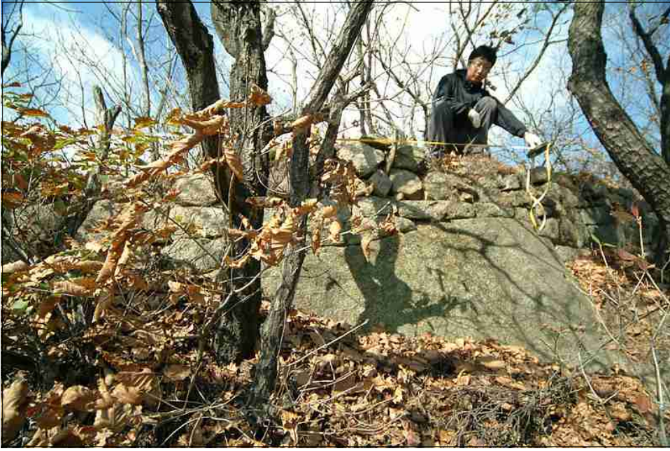
NO.37 +18 ~ NO.38 +0