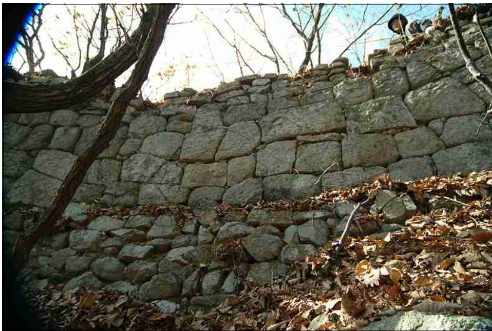
NO.39 +5 ~ +10