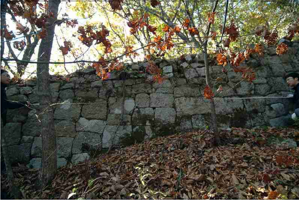
NO.32 +19 ~ NO.33 +4