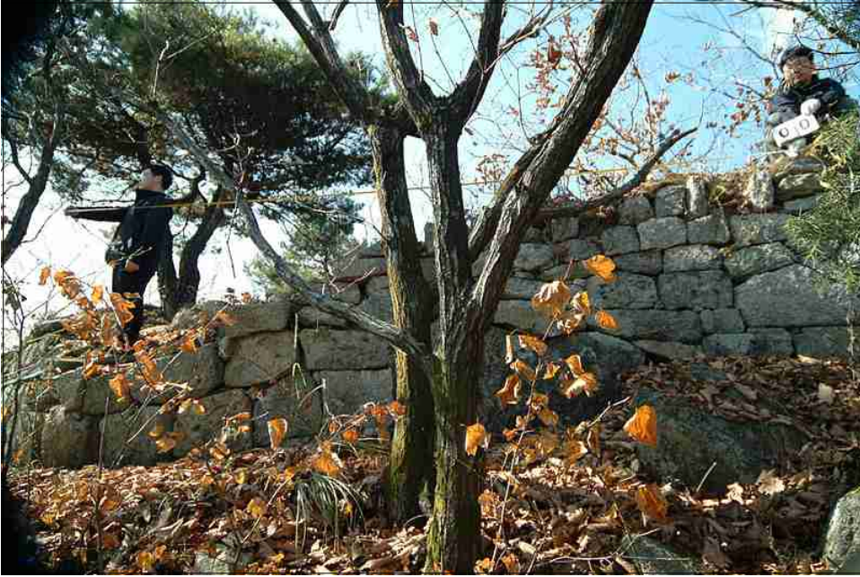
NO.41 +12 ~ +17