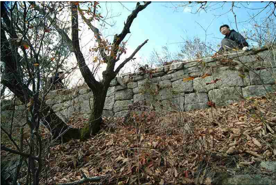
NO.36 +15 ~ NO.37 +0