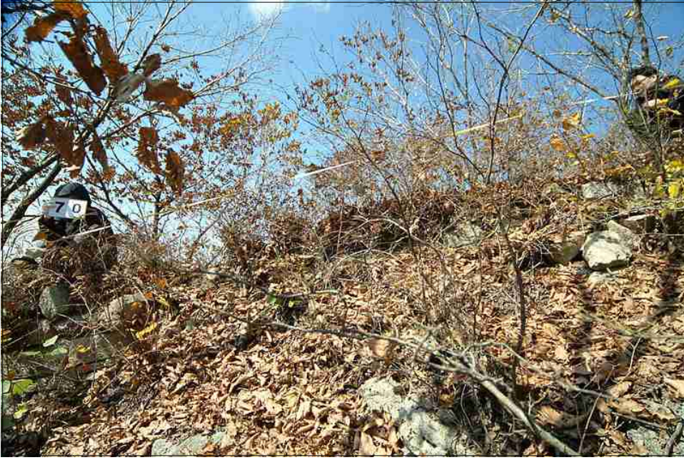
NO.40 +10 ~ +15