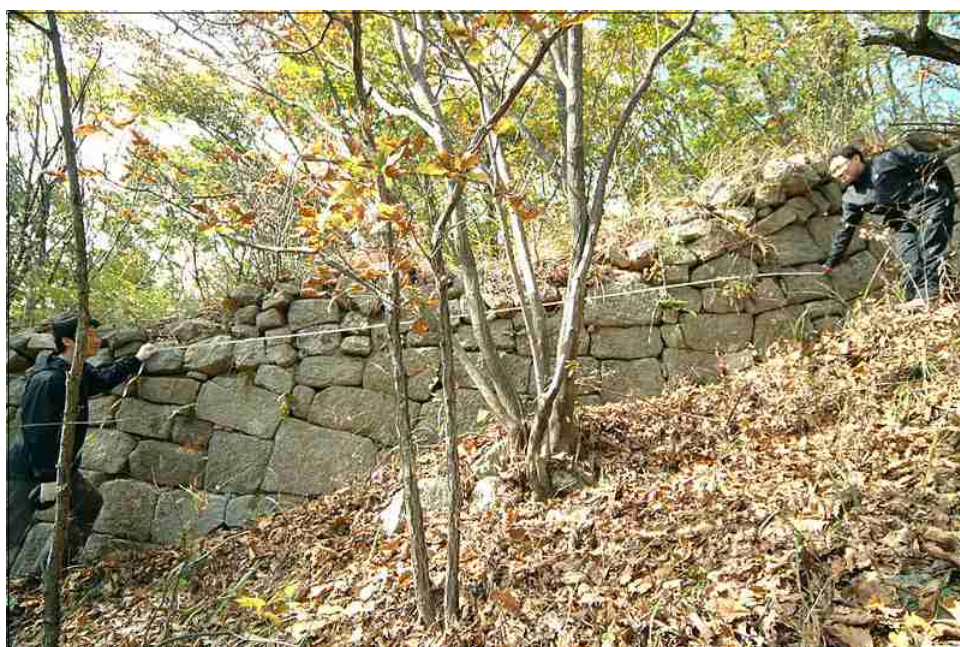
NO.34 +13 ~ +18