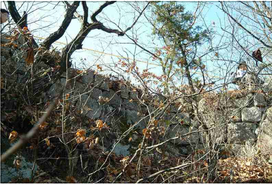
NO.43 +10 ~ +14