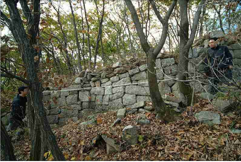
NO.35 +3 ~ +8