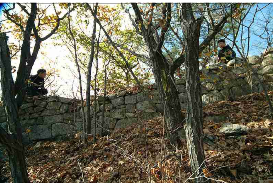
NO.36 +7 ~ +10