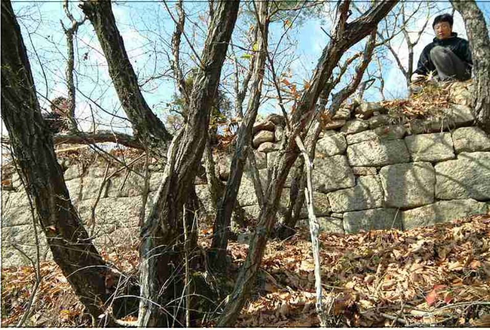
NO.37 +5 ~ +10