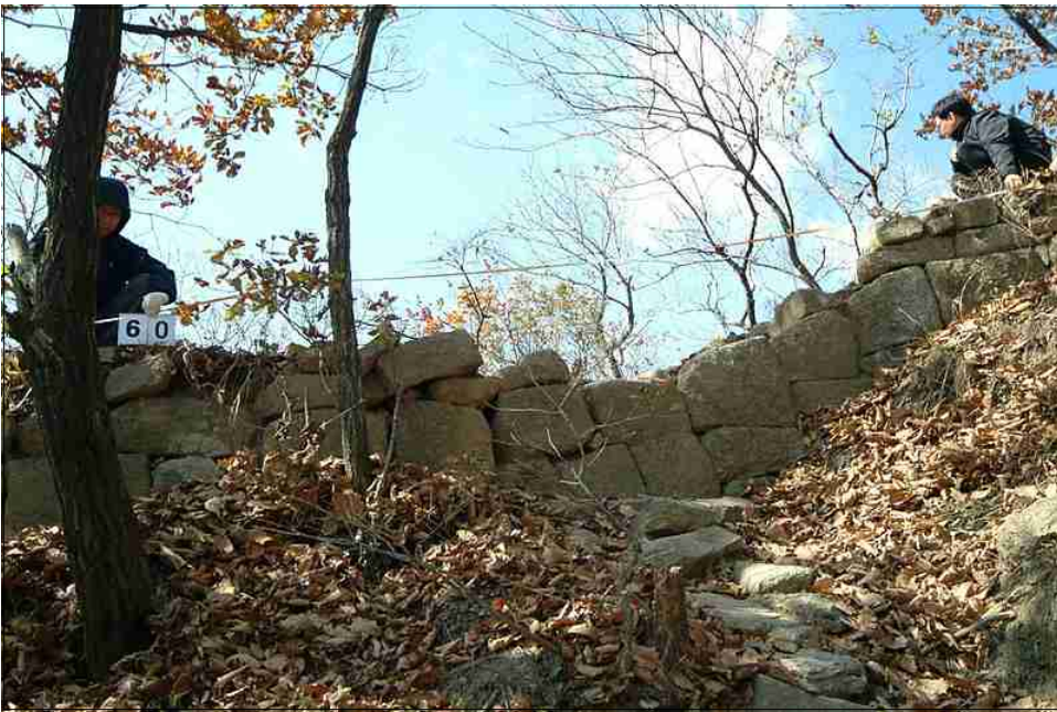
NO.40 +0 ~ +5