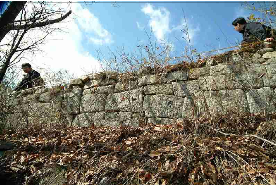
NO.37 +0 ~ +5