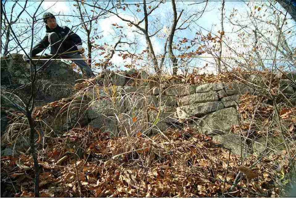
NO.38 +10 ~ +13