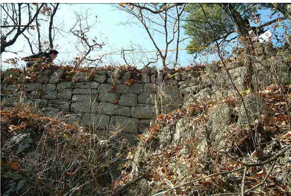
NO.42 +0 ~ +5