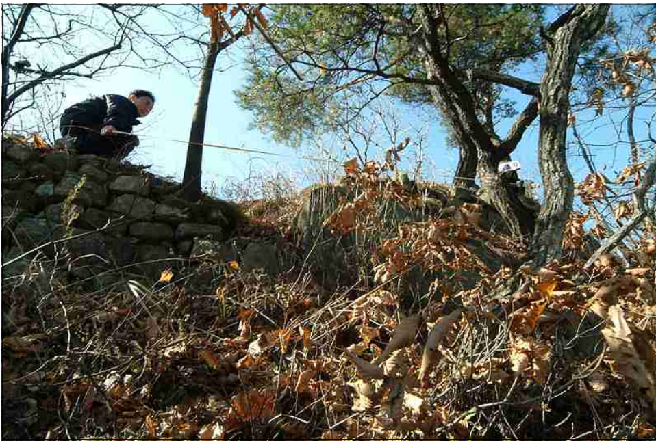
NO.43 +0 ~ +5