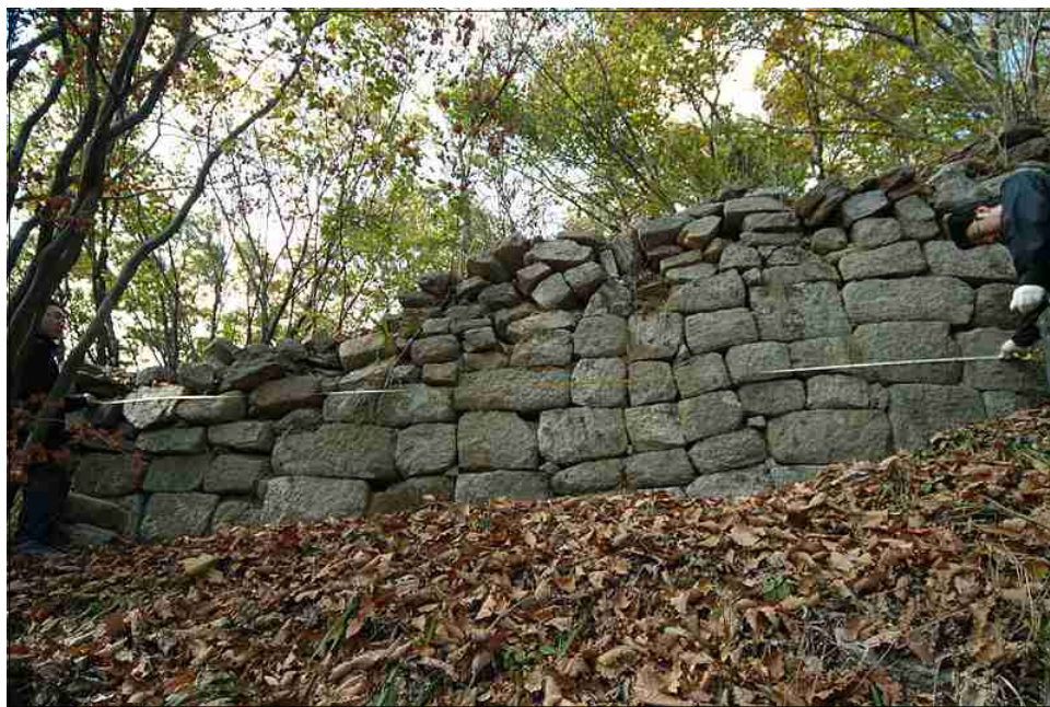
NO.34 +8 ~ +13