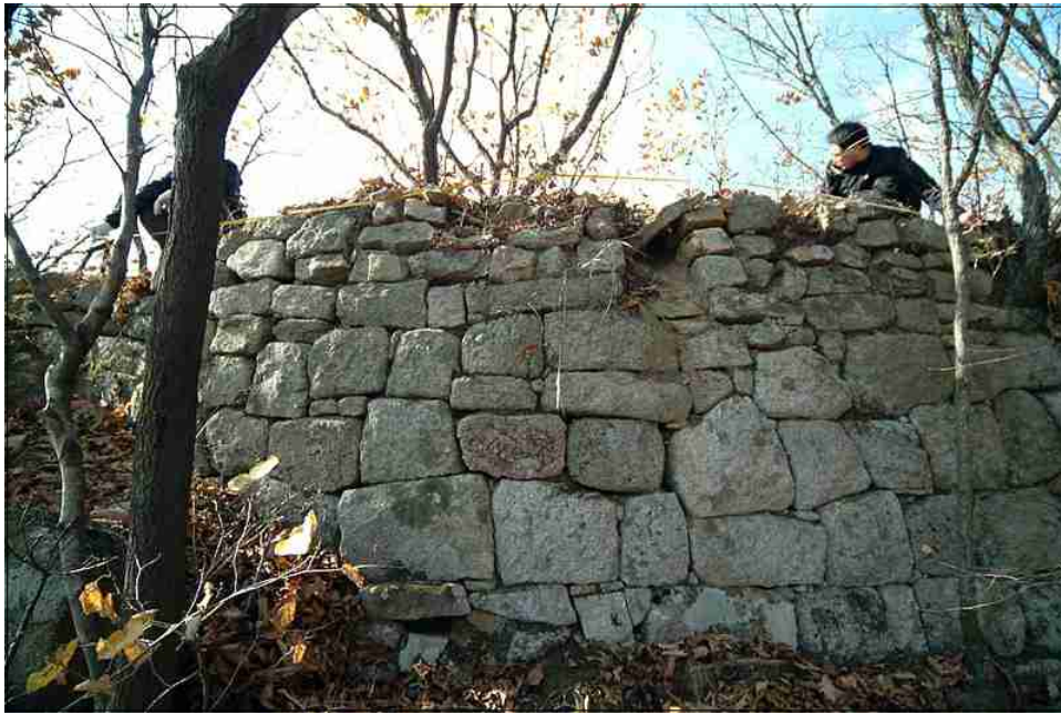
NO.38 +19 ~NO.39 +5