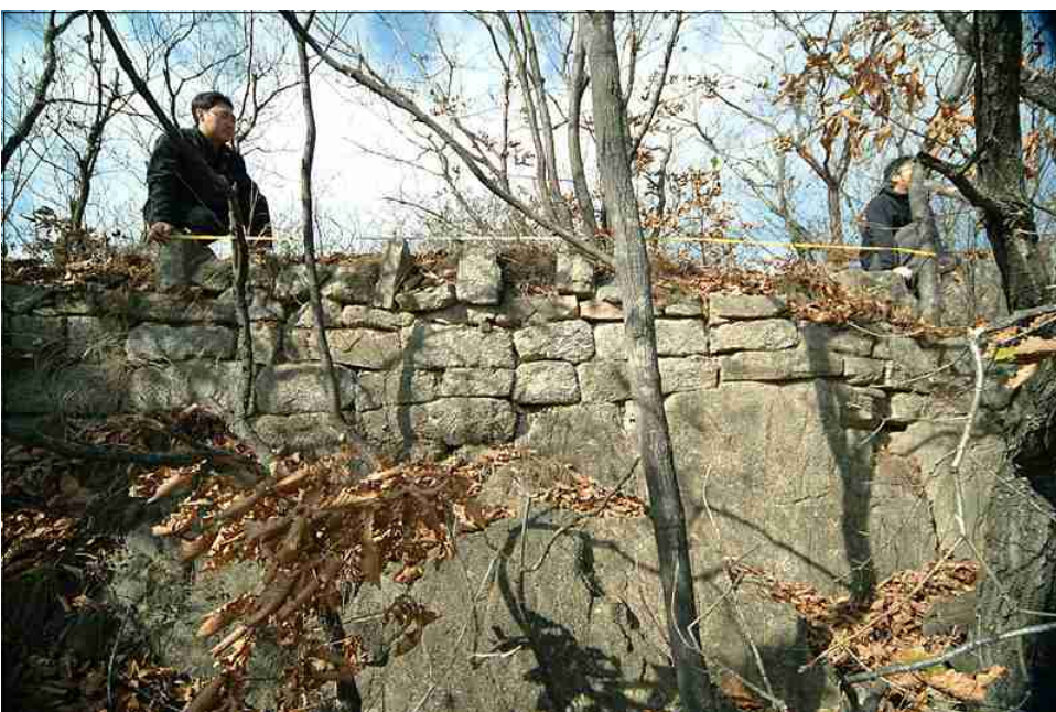
NO.38 +5 ~ +10