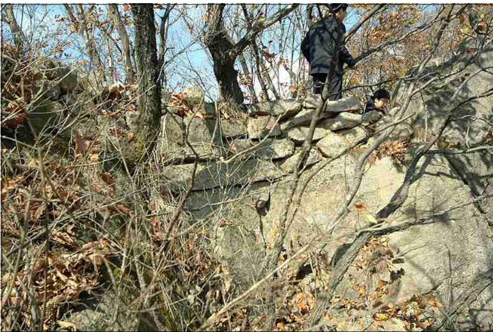
NO.38 +15 ~ +19