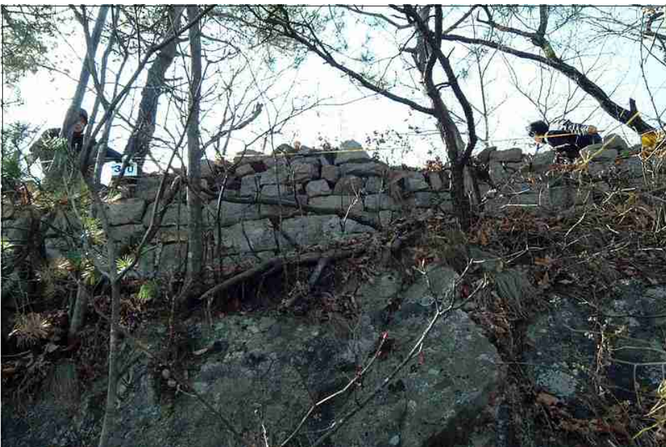
NO.43 +5 ~ +10