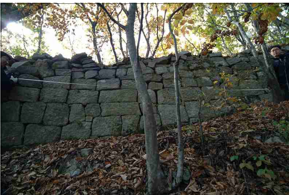
NO.32 +14 ~ +19