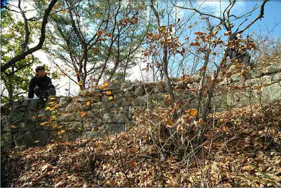
NO.36 +10 ~ +15