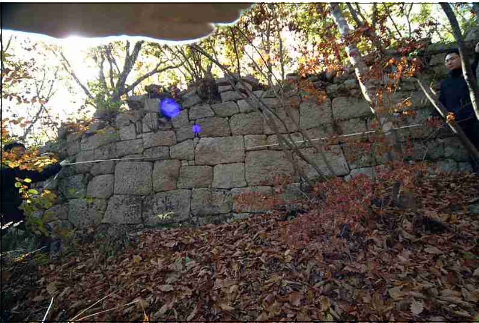
NO.33 +4 ~ +9