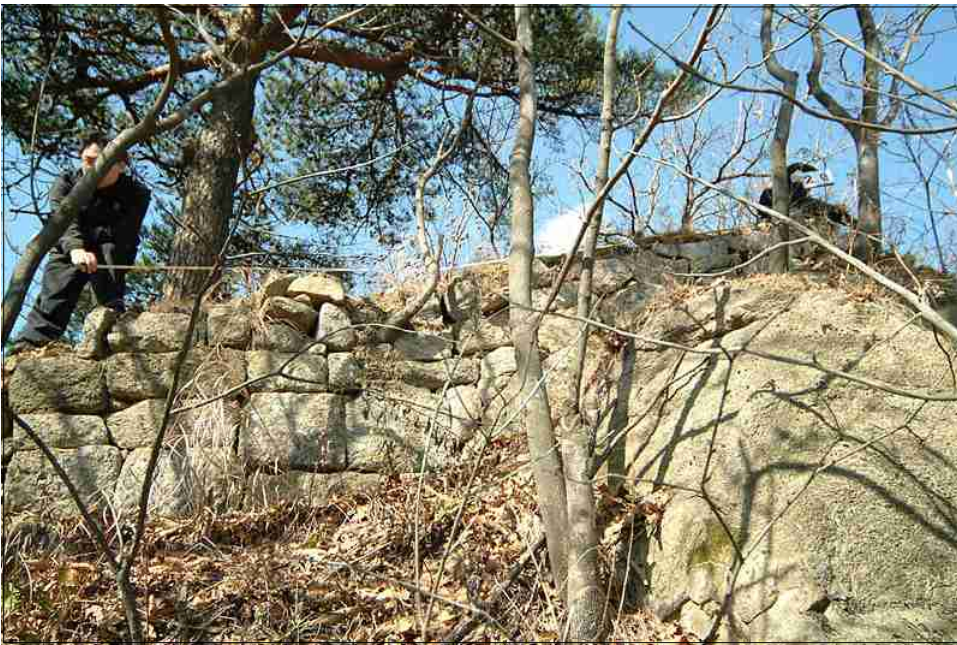
NO.42 +10 ~ +13