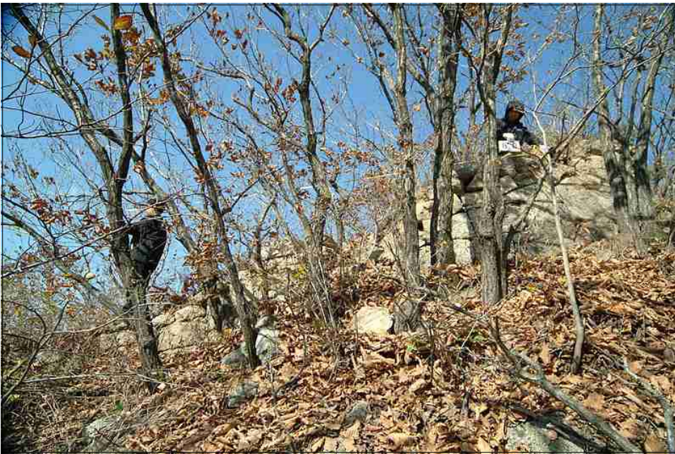
NO.40 +15 ~ +18