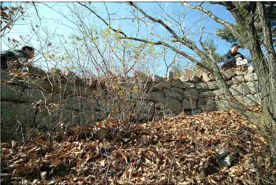
NO.41 +5 ~ +8