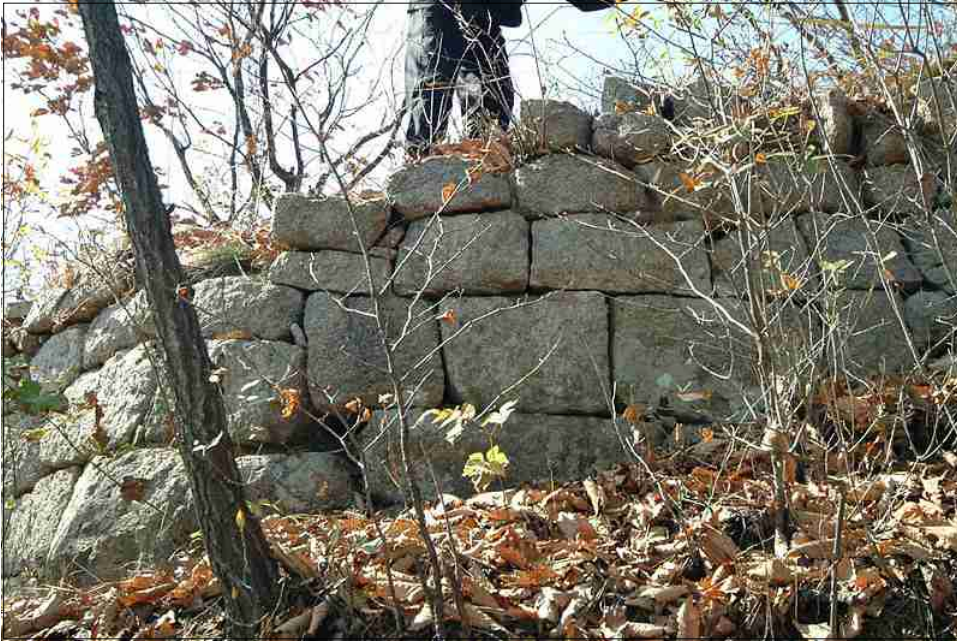
NO.41 +2 ~ +5