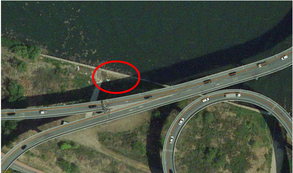
성수대교 남단측 둔치