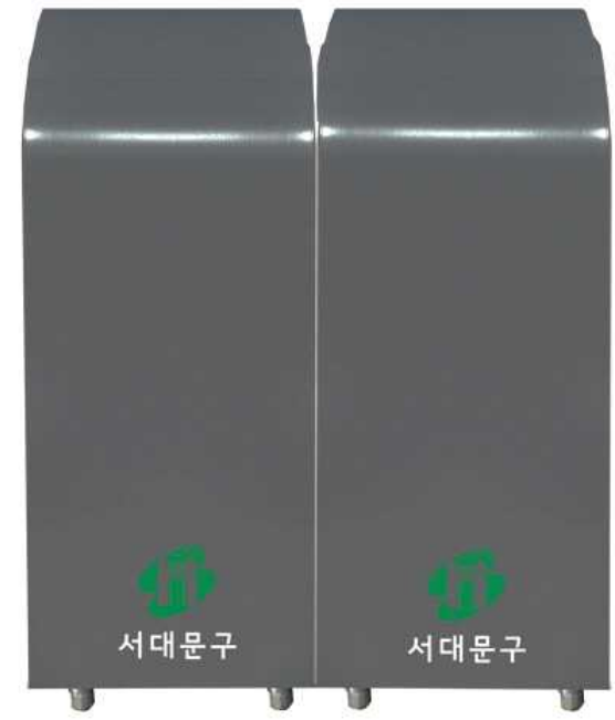
[후면도] [rear side elevation]