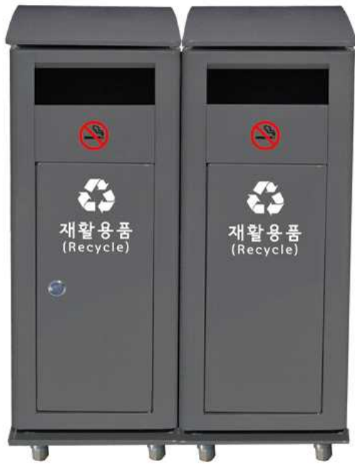
[정면도] [a front view]